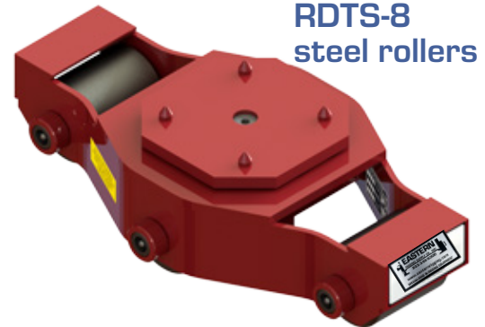
RDTS-8 steel rollers