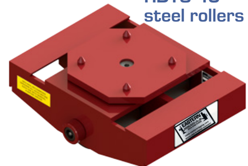
RDTS-40 steel rollers