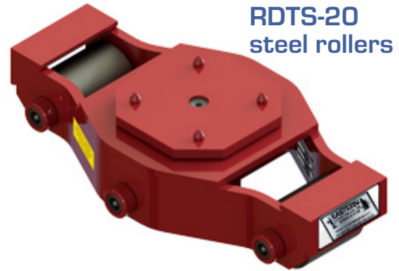
RDTS-20 steel rollers