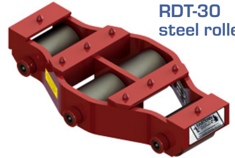
RDT-30 steel rollers