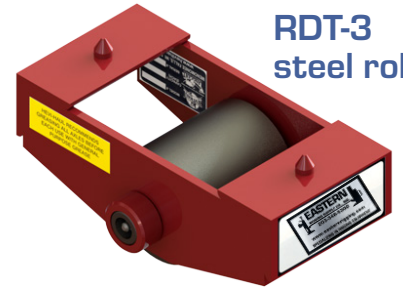
RDT-3 steel rollers