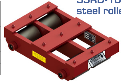
SSRD-1040 steel rollers